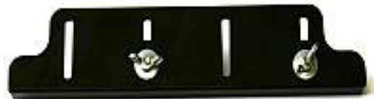
Adjustable Fence included with the Slicer

Available Slicing Fixture for guiding your work through the blade. A built-in clamp holds your work securely, and the rail insures that the cut is straight.