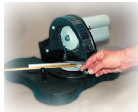
Miter table adjusts easily a full \pm 45^\circ