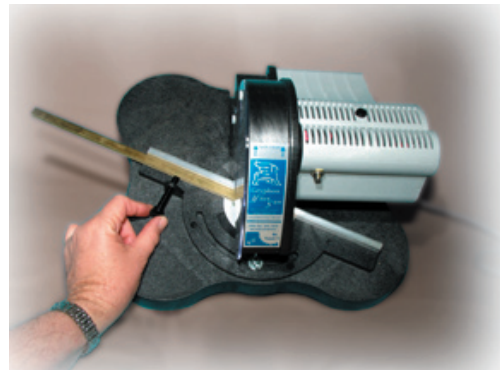
A simple clamp holds your work securely