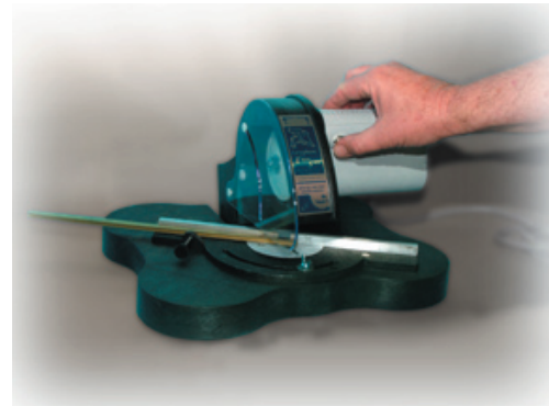
Chop saw design is fast and convenient

All mechanical components are guaranteed against failure for one year. If such a failure occurs for any reason other than abuse or misuse during this period, it will be repaired (or at our option replaced) free of charge FOB our factory. Blades will eventually wear or break, even in normal use. Their life cannot be guaranteed. Cosmetic damage is not covered under the warranty.